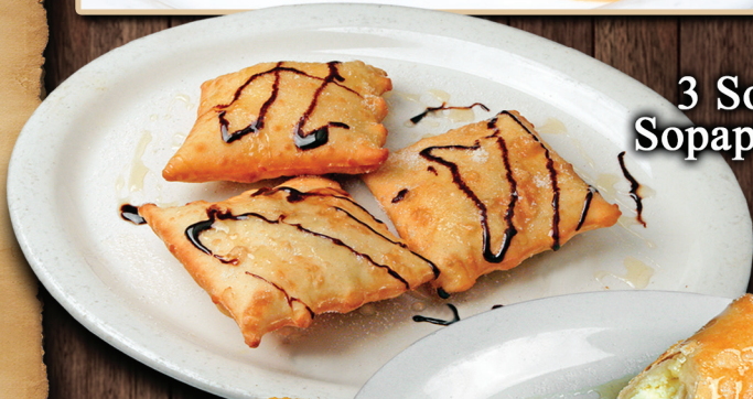
3 Soft Sopapillas