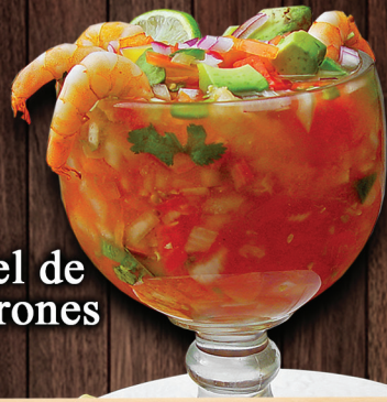
Coctel de Camarones

Three soft corn tortillas with melted Chihuahua cheese filled with shrimp cooked with peper onion and tomato served with rice lettuce and sliced of avocado