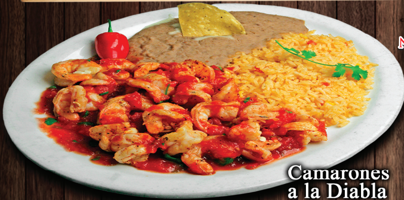
Camarones a la Diabla

Notice: Consuming raw or undercooked meats, poultry, seafood, shellfish or eggs may increase your risk of food borne illness, especially if you have certain medical conditions. To our guests with food sensitivities or allergies: Salsas Restaurant cannot ensure that menu items do not contain ingredients that might cause an allergic reaction. Please order with caution.