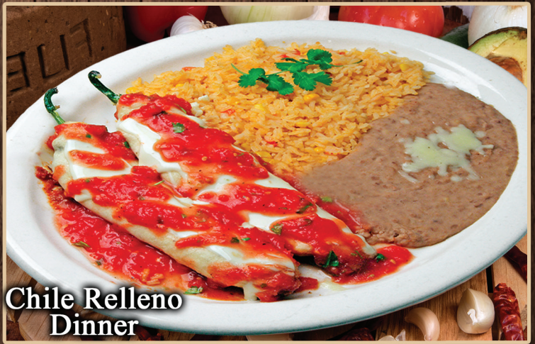
Chile Relleno Dinner