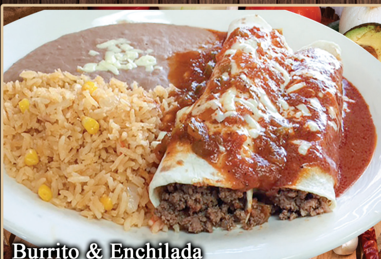
Burrito & Enchilada