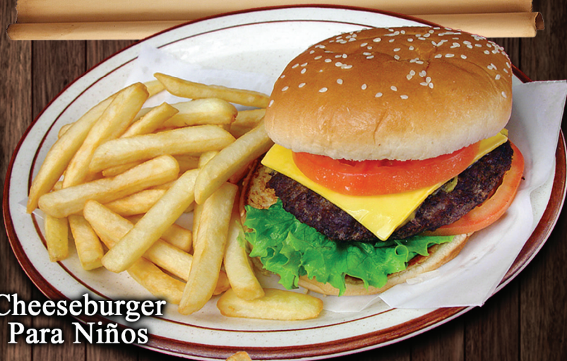
Cheeseburger Para Niños

Two flour tortilla stack with five cheeses and ground beef topped with cheese, mushrooms and chili sauce, served with rice and beans