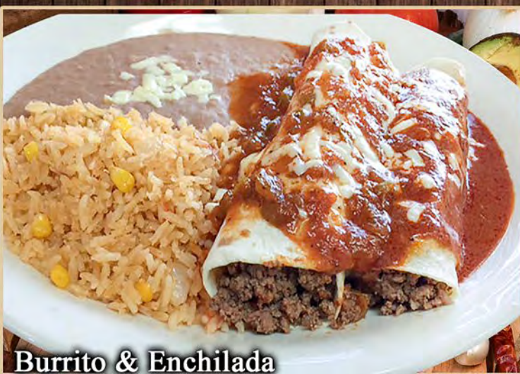
Burrito & Enchilada