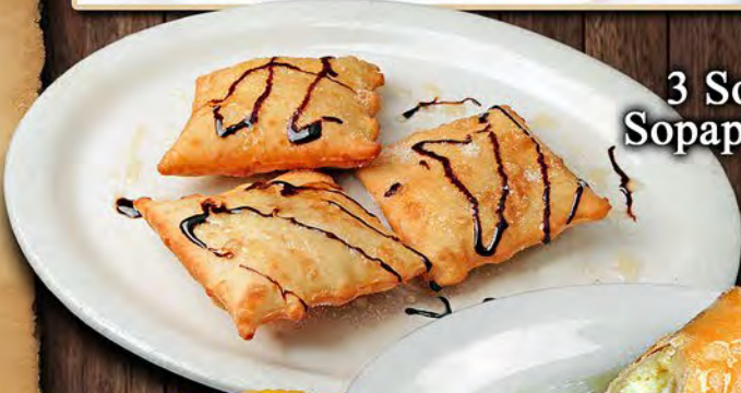
3 Soft Sopapillas