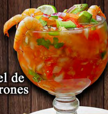
Coctel de Camarones

Three soft corn tortillas with melted Chihuahua cheese filled with shrimp cooked with peper onion and tomato served with rice lettuce and sliced of avocado