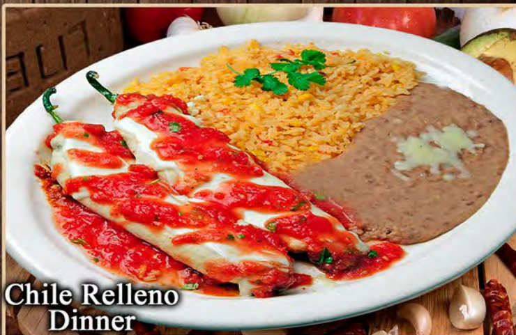
Chile Relleno Dinner