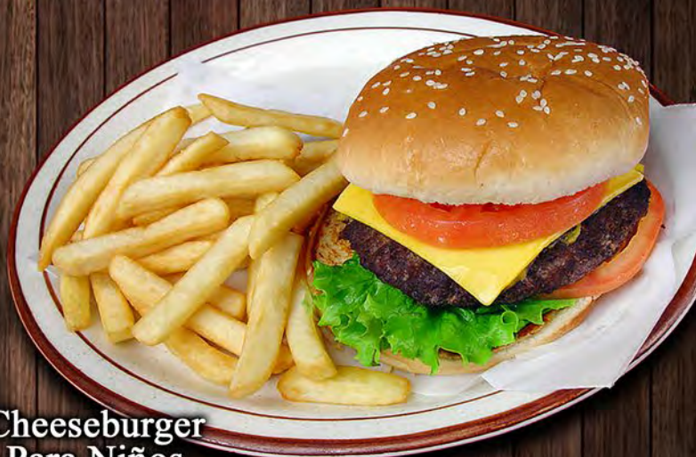
Cheeseburger Para Niños